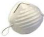
Dust “nuisance” mask